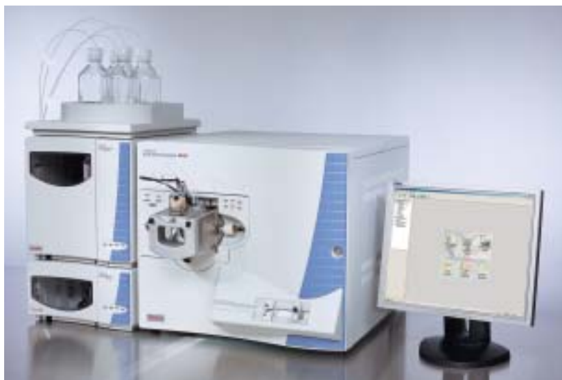
The Finnigan Surveyor LCQ Advantage MAX LC/MS/MS system provides fully integrated analyses using the powerful Xcalibur operating system.